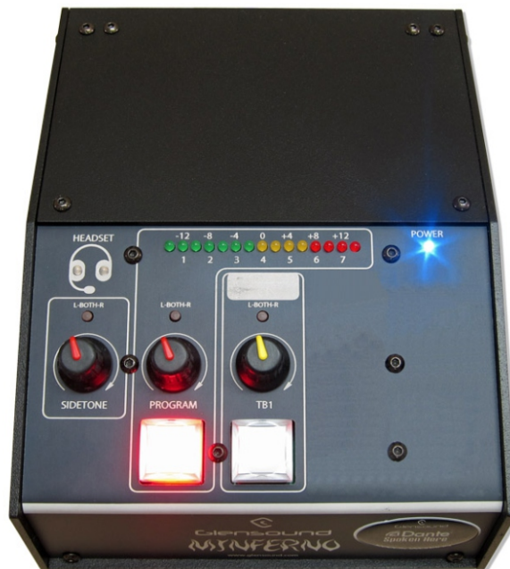
MinFerno/1 Commentator's Box